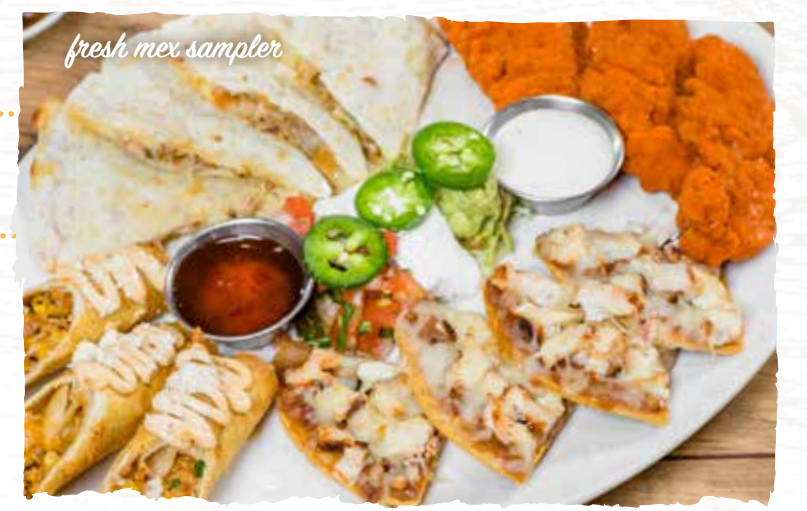
fresh mex sampler