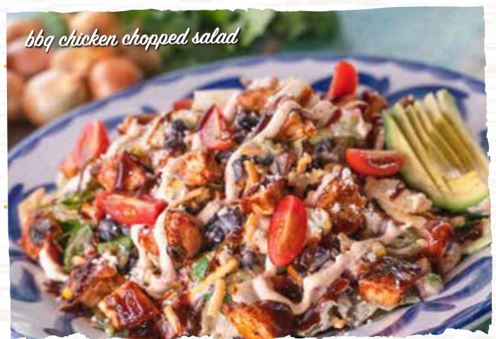
bbq chicken chopped salad