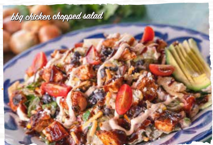
bbq chicken chopped salad