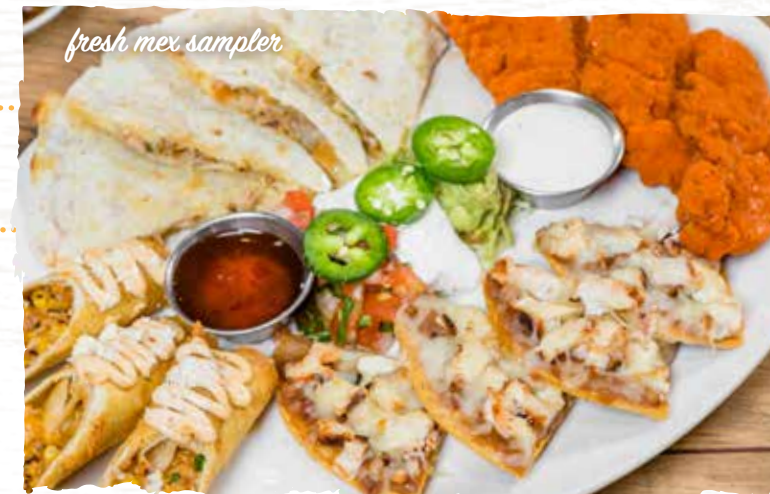
fresh mex sampler