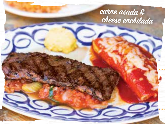
carne asada & cheese enchilada

CARNE ASADA & CHEESE ENCHILADA citrus-marinated steak* and a cheese enchilada with new mexico red chile sauce topped with jack cheese. served with rice and beans a la charra 20.50