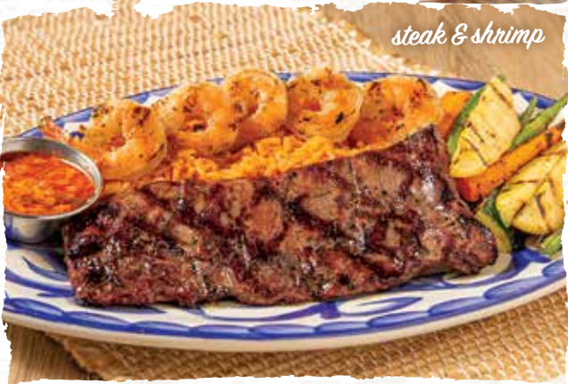
steak & shrimp

GRILLED SALMON seared salmon served with seasonal veggies, cilantro-lime rice and pineapple salsa 21.00