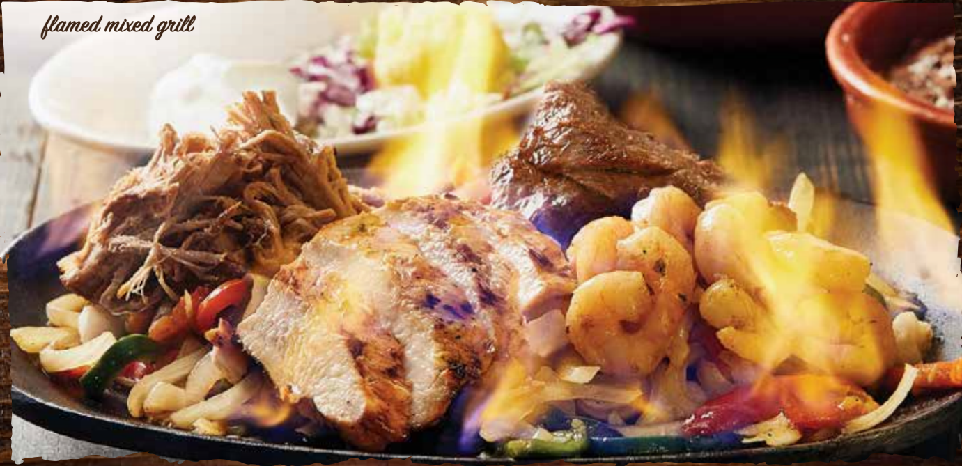
flamed mixed grill

our signature sweet corn tamalito and choice of beans a la charra, refried beans or vegetarian black beans