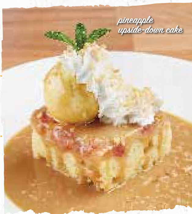
pineapple upside-down cake

warm pineapple upside-down cake, on a bed of kahlúa cream sauce. topped with vanilla ice cream, whipped cream & toasted coconut 8.00