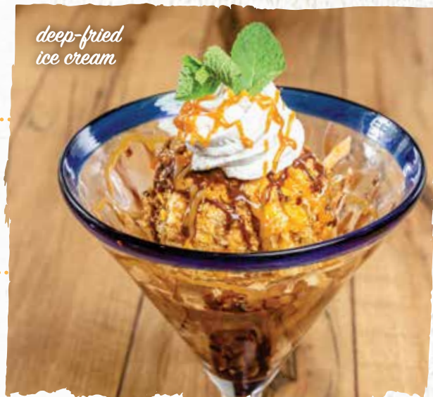
deep-fried ice cream

fresh baked brownie, rich vanilla ice cream drenched in homemade cajeta caramel and chocolate sauces topped with crushed oreo cookies and whipped cream 7.75