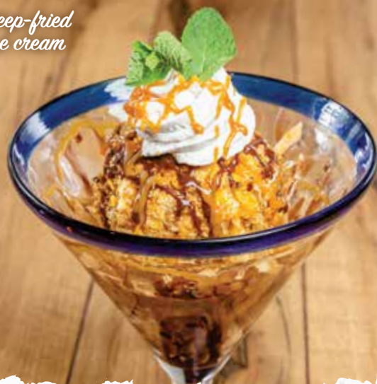
deep-fried ice cream

fresh baked brownie, rich vanilla ice cream drenched in homemade cajeta caramel and chocolate sauces topped with crushed oreo cookies and whipped cream 9.00