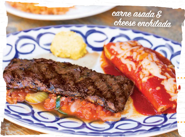
carne asada & cheese enchilada