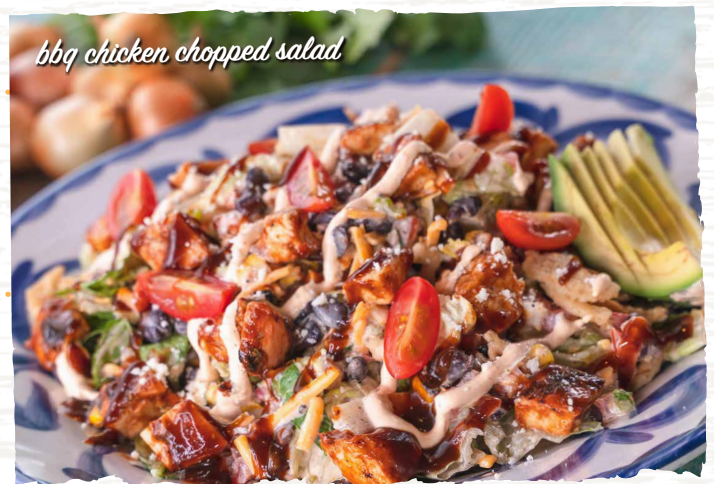
bbq chicken chopped salad