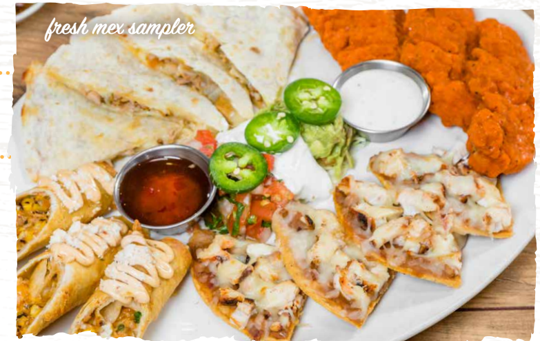
fresh mex sampler