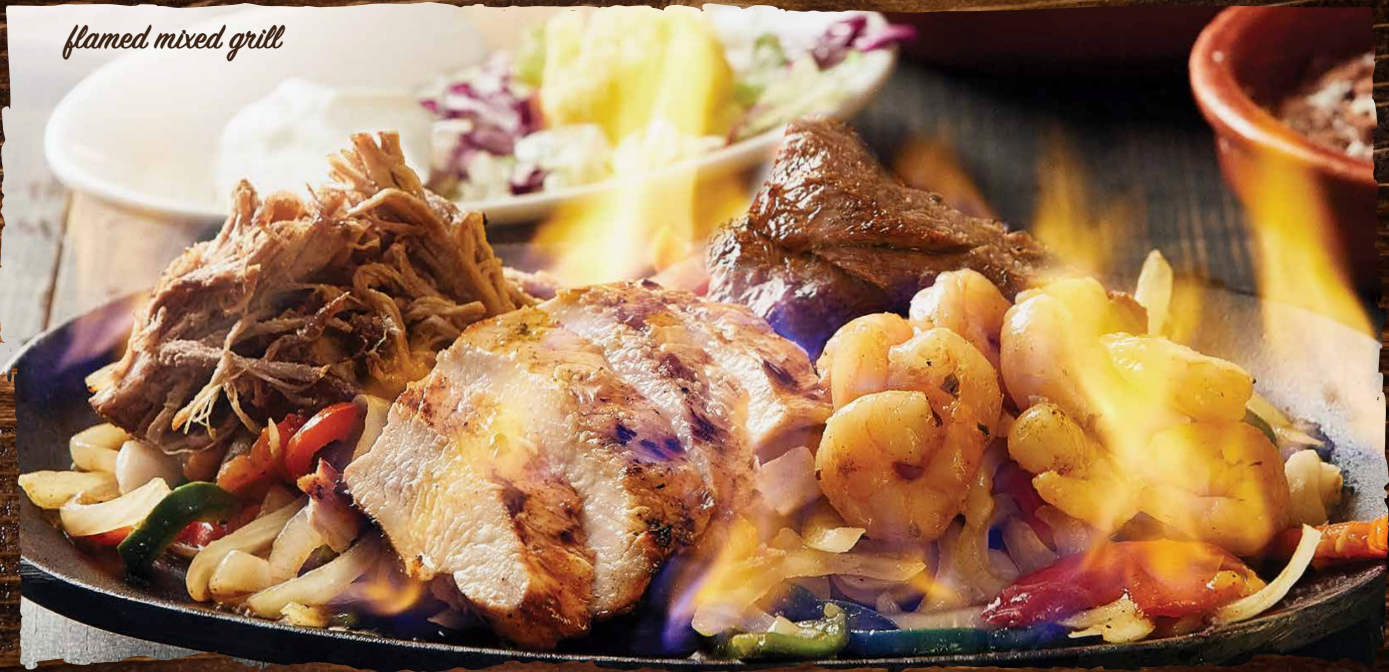
flamed mixed grill

our signature sweet corn tamalito and choice of beans a la charra, refried beans or vegetarian black beans