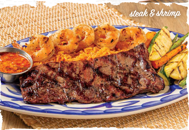
steak & shrimp

seared salmon served with seasonal veggies, cilantro-lime rice and pineapple salsa 22.00