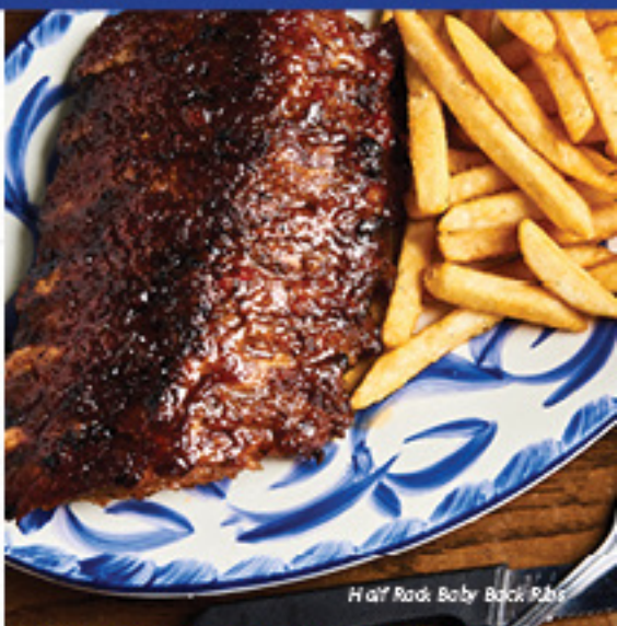
Half Rack Baby Back Ribs

Grilled Chicken, avocado, three cheese blend, lettuce, pico de gallo, tortilla strips, chipotle ranch dressing, flour tortilla. With french fries 13