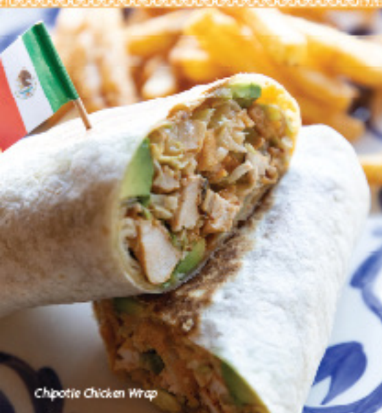
Chipotle Chicken Wrap